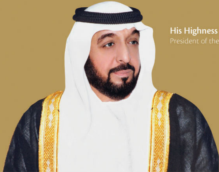
His Highness Sheikh Khalifa bin Zayed Al Nahyan President of the United Arab Emirates

“ Work is a true criterion of citizenship . It is evidence of sincerity and loyalty . We all share the responsibility of building this country, protecting its sovereignty and safeguarding the gains”