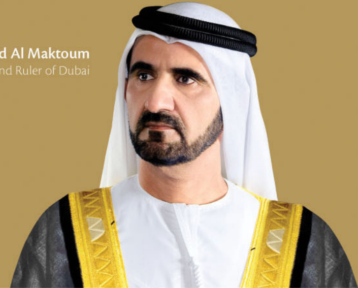
HH Sheikh Mohammed Bin Rashid Al Maktoum UAE Vice President, Prime Minister and Ruler of Dubai

“ The word ‘impossible’ is not in leaders’ dictionaries. No matter how big the challenges , strong faith , determination and resolve will overcome them”